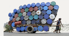
Three people pulling a cart of used containers in Dhaka, Bangladesh.