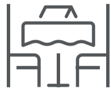
Table service only

Please order at the table with your assigned server and not at the bar.